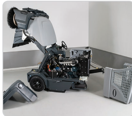
MaxAccess™ allows faster repairs and less downtime so the sweeper spends less time in the shop and more time sweeping.