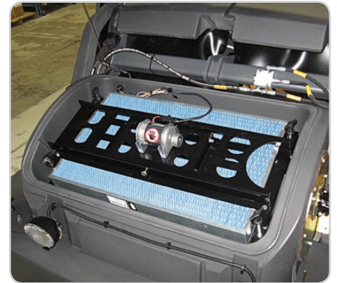
Ultra-Web® dust filter is >98% efficient on 0.3 - 1 micron dust. All dust is locked in the hopper behind only 1 critical seal incorporated in the dust filter. Captured dust is shaken directly back into the hopper.