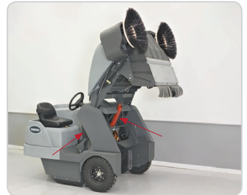
For optimal safety, the hopper safety arm can be engaged without leaving the operator seat. In addition, the sweeping systems automatically stops when the machine motion stops.