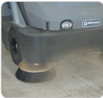
DustGuard™ suppresses side broom generated dust allowing continuous use, and increasing, dust controlled productivity by over 70%.