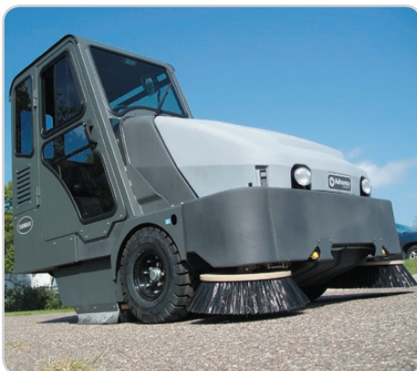
The optional all weather cab keeps the operator comfortable and productive. Clear-View™ window in the cab provides a safe view of the right side broom.