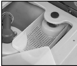
An integrated debris catch cage traps and collects drain clogging debris.