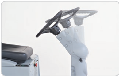
Steering is adjustable to five positions for operator comfort.