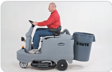
Equipped with optional accessory kits, the Advolution™ 2710 becomes multi-functional.