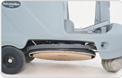
Mid-mounted, burnishing head tilts up for access to change burnishing pads quickly and easily.