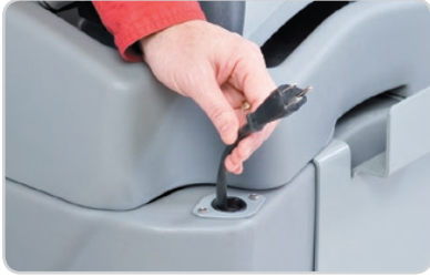
Plug for onboard charger option is easily accessible.