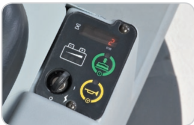
Simple, One-Touch™ operators button.