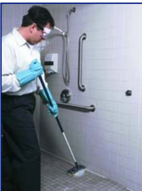
Scrub floors, walls and fixtures to remove scum and soil buildup from surfaces.

The Model 750 All Surface Cleaner: A brilliant way to spend your cleaning dollars and time.