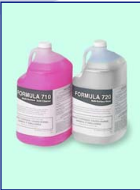
Formula 710 and 720 cleaning formulas—designed for use on hard, tiled surfaces such as restrooms and shower areas.