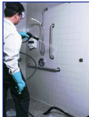
Use high pressure setting to rinse tiled area from top to bottom.