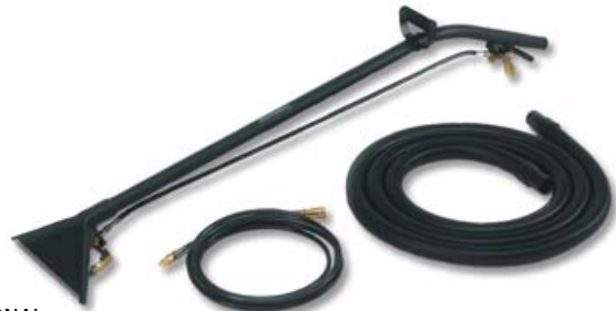
OPTIONAL CARPET EXTRACTION KIT