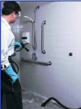
Use the low pressure setting to apply the Formula 710 Multi-Surface Cleaner.

Tennant has just the right solution for the number one cleaning challenge: restrooms and other hard surfaces. The Model 750 All Surface Cleaner can clean up to three times faster and more thoroughly than the manual “wipe down” method, which misses corners and hard to reach areas and just spreads the dirt around.