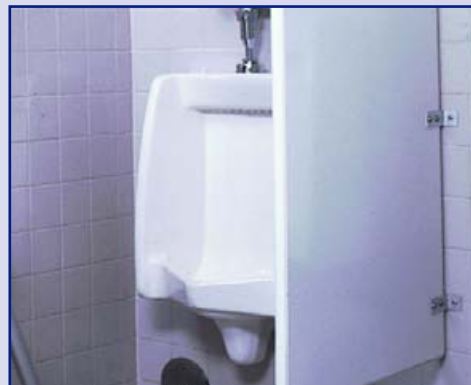
Urinals and toilets