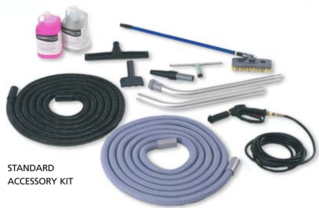
STANDARD ACCESSORY KIT

Double-bend aluminum wand, 25 ft/7.6 m, 1.5 inch diameter recovery hose-black, scrub brush, 25 ft/7.6 m blower hose-gray, 25 ft/7.6 m high pressure hose with quick connect variable pressure gun, floor squeegee tool, hand squeegee tool, blower tool, gulper floor drain tool, fill hose, metering tip packet, 1 gal/3.8 L Formula 710 Multi-Surface Cleaner and Formula 720 Rinse.