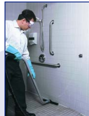
Recover dirty water into the recovery tank with the floor squeegee tool.