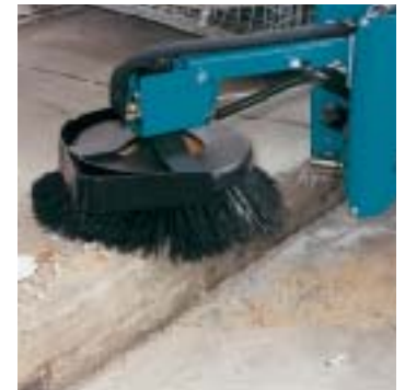
While the main brush sweeps debris on street level, the SB2 cleans up on the curb.