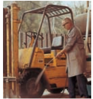
The high pressure spray option goes to work wherever you need it — blasting away grease, oil and dirt.

The Model 550 Industrial Scrubber is built extra-tough to tackle your industrial-sized jobs. But that's just the beginning. The 550 both scrubs and sweeps — and it's extremely maneuverable.