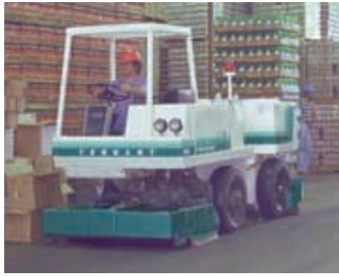
Driver's view is unobstructed and controls are easy to reach.