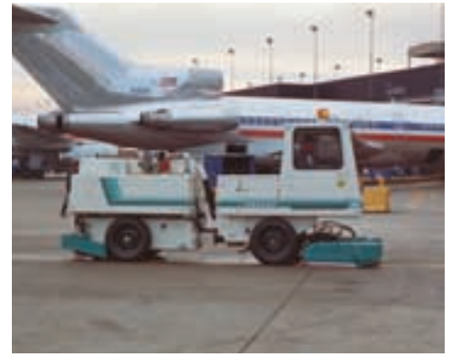
The 1550 efficiently picks up de-icing fluid from runways and covers 12 times the area of standard scrubbers without the need to empty and refill the solution tanks.