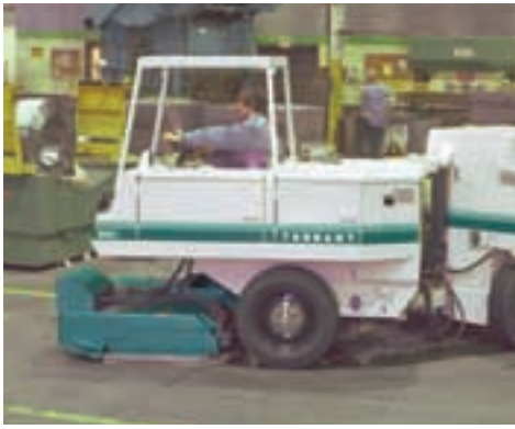
Articulated power steering makes it easy to maneuver, even around sharp corners.