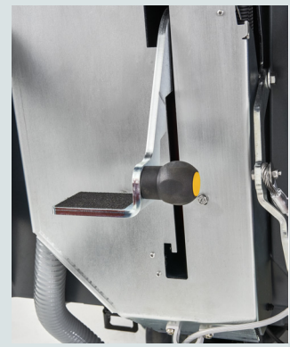
A simple mechanical deck lever removes the complexity, unreliability and service costs associated with alternative methods.