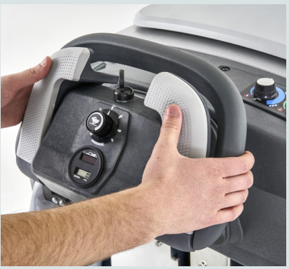
No confusing buttons or switches for a simple and easy to use machine.