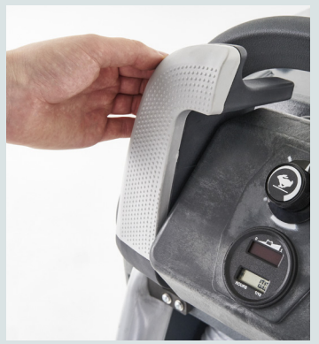
Move paddle backwards to go in reverse, frontwards to go forward; it could not be simpler or safer.