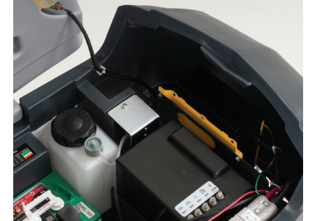
The EcoFlex™ System provides the most flexible cleaning solution for today's cleaning applications with full control over water and chemical consumption.