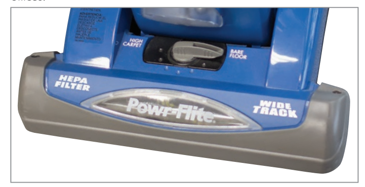
Quiet 69 dBA motor

Improve the indoor air quality while vacuuming with the versatile Powr-Flite PF82HF containing a sealed HEPA filtration system. Certified Bronze by the Carpet and Rug Institute, the PF82HF is UL listed for commercial use and includes a washable HEPA filter that captures dust and allergen particles down to .3 microns in size. The oversized diameter hose resists clogging and stretches to 10 feet. Additional features include a one piece handle, on-board cleaning tools, a quiet commercial-grade motor, headlight and a 15" cleaning width. Safety features include a bag lid safety latch to prevent operation of the unit without the bag in place. The perfect combination of features, power and filtration, the PF82HF is an excellent choice for hospitals, schools, nursing homes and busy offices.