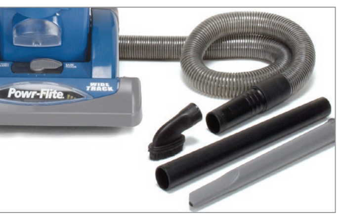
On-board cleaning accessories