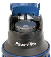
Non-conductive base & motor housings!