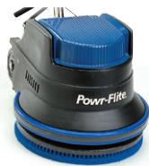
One piece base and motor housing!