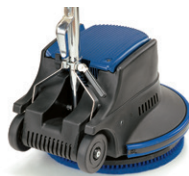
No exposed wires or capacitors!