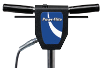
Safety lockout with steel activating levers