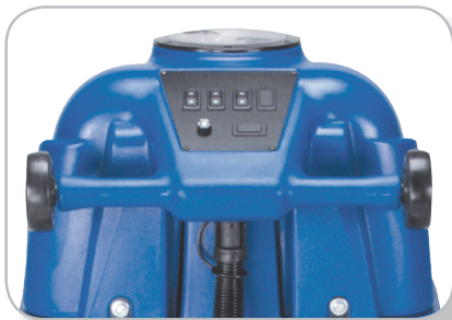
Handle-mounted transport wheels ease loading and unloading.