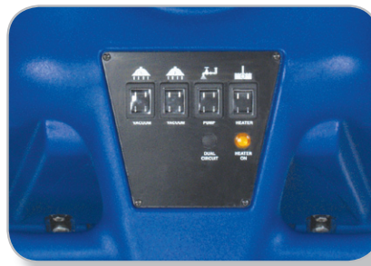
All electronic components are independently controlled.