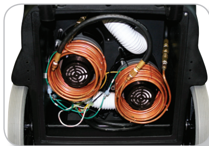
Patented Perfect Heat® system maintains the hottest solution temperatures available in a portable extractor.