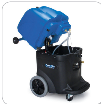
Clam Shell design provides easy access to mechanical components.