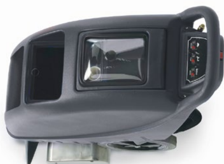
Compact size for use in offices, schools, healthcare facilities and hotels