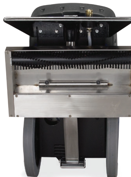
Long-lasting stainless steel brush housing features two easily removable spray jets for even spray pattern