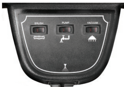
Easy access control panel