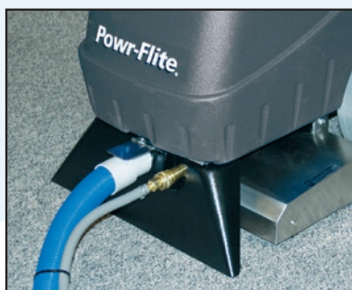
Front connection for upholstery tool

The PFX900S provides superior cleaning power with a floating brush head that maximizes agitation and leaves the carpet cleaner. You never have to worry that you don't have the brush at the proper level – it needs no adjustment. The powerful 1300 RPM chevron style brush agitates and removes soil other self-contained extractors leave behind. Solution is delivered at 100 p.s.i. through two spray jets for even application. replacement and troubleshooting.