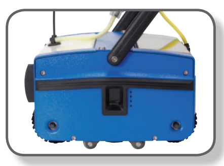
Low profile makes for easy cleaning under chairs and food prep areas.