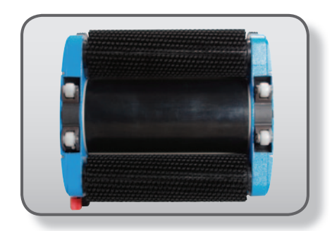
Contra-rotating brushes and recovery drum clean and clear debris in one pass.