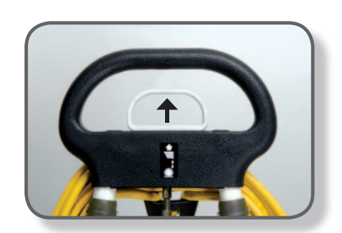
Pull handle dispenses solution on to floor.

The Multiwash offers quiet, high quality cleaning performance, versatility, ease of use and durability. This machine will wash, mop, scrub and dry in a single pass on virtually every kind of floor. The Multiwash can even be used on escalators and entrance matting.