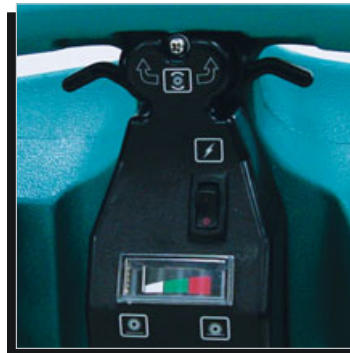
Ergonomic handle with trigger solution control allows for comfortable operation.