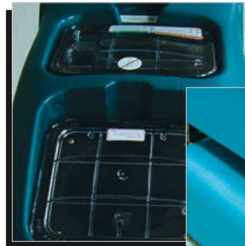
Square, lift-off solution and recovery covers are easy to use.