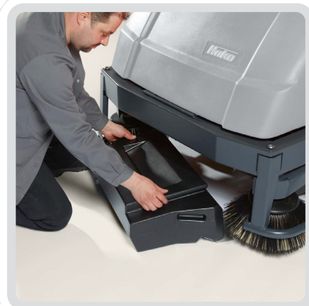
Tool-free removal of dirt hopper allows for quick and easy emptying.