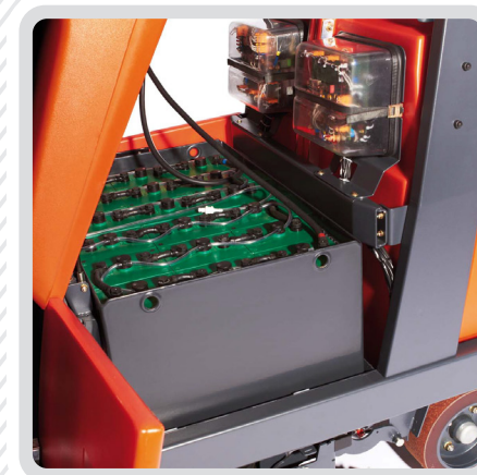
Optional industrial case battery and charger available for extended runtime.