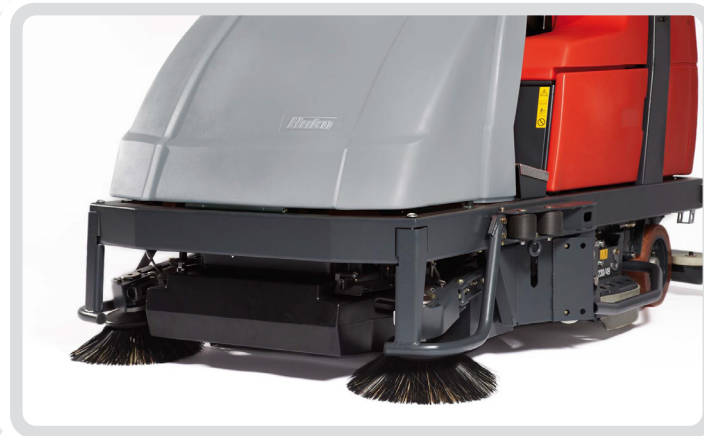
The powerful sweeping system removes dry dust and debris from the floor before scrubbing.

Two functions in one machine, sweep independently, scrub independently or sweep and scrub in one pass.