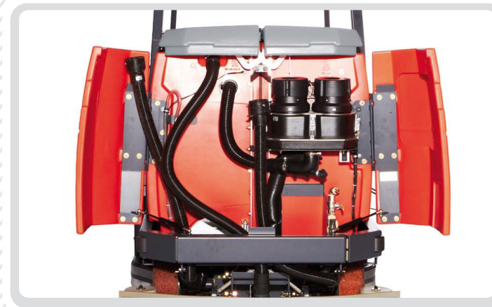
Direct access to parts and systems provides easy access for maintenance and service.