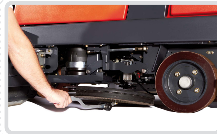
The three powerful scrub brush motors guarantee an even 48" cleaning path across the entire width of the machine.