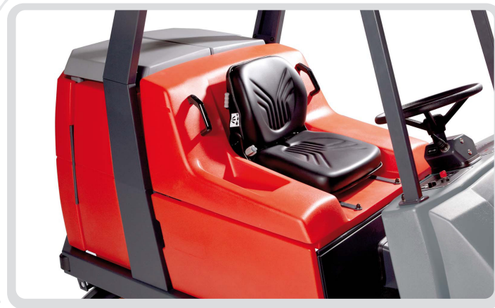
An ergonomically optimized driving position gives users of widely differing builds a comfortable seat and a perfect view of the working surface.