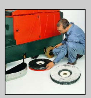
Brushes: Brushes and pads can be changed in a flash without the use of tools.