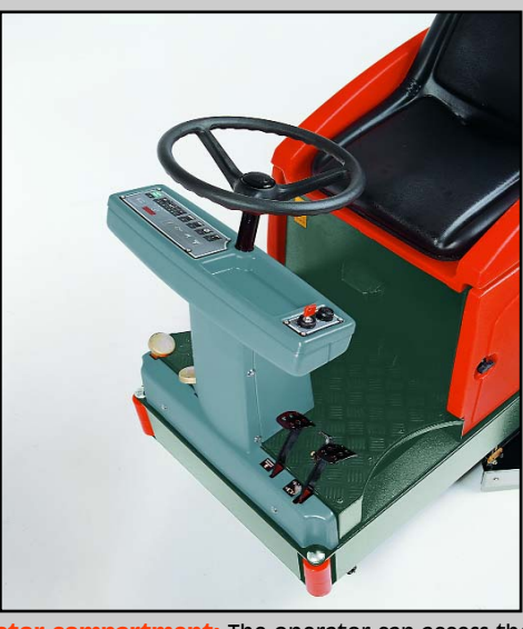
Operator compartment: The operator can access the driver's seat from both sides with an excellent view of the area to be cleaned. All operating elements are in direct view and easy reach of the operator. Adjustable, comfortable driver's seat.