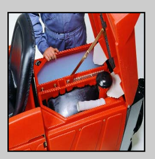
Tank: Large flexible wall tank, 37 gallons. Outlet hoses with dosage device for quick