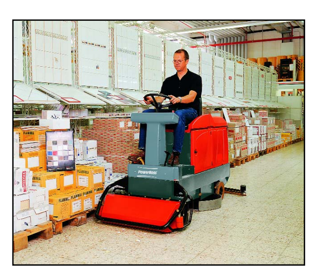
With pre-sweep and tool: Pre-sweeping and scrubbing in one operation, additional scrubbing and vacuuming tool for edges and corners.