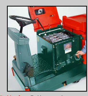
Batteries: Battery system easy to access with quick exchange device (optional equipment).