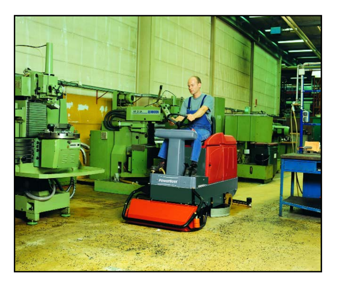
Admiral 35: For perfect maintenance or basic cleaning. Highly maneuverable, compact, easy, light handling, powerful and efficient.