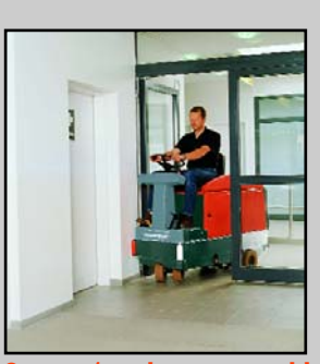
Compact and maneuverable: Fits through any standard door. Minimum passing width of 27in.