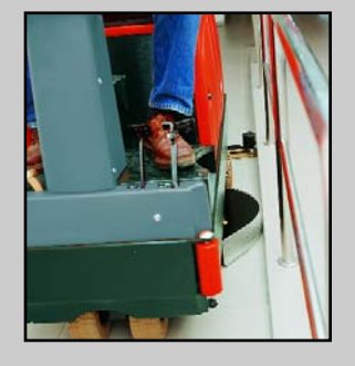
Working close to the edge: Poses no problem with protruding brushes and suspended squeegee.