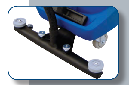
Self-adjusting squeegee blades.