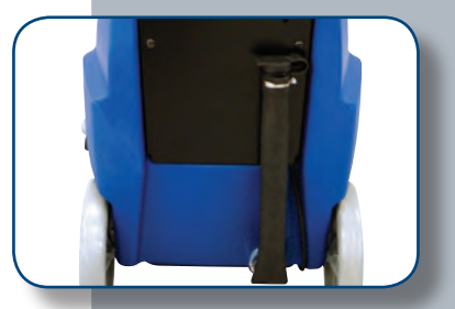
Unique tank design allows for 100% dumping without tipping