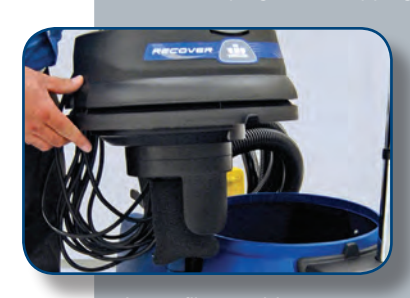
Large filter enables a constant high suction power and long working intervals without interruption.