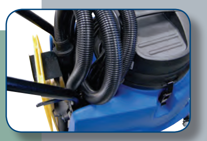
Tool compartment with safety sign storage bracket.