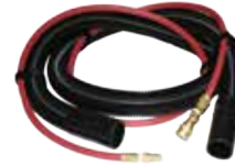
External hoses set