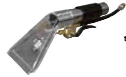
Stainless steel tool w/ clear view head & brass valve & jet