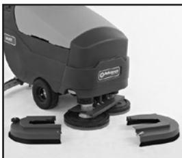
Heavy duty deck skirting system