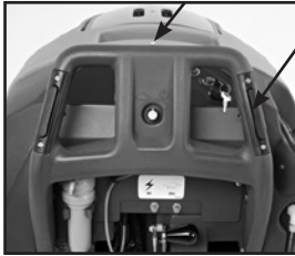
Easy to use palm switches on durable handle