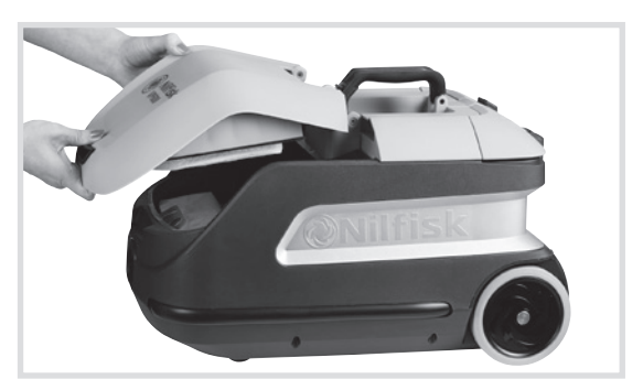
Lid latches horizontally or vertically for low-profile storage.