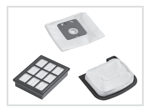
Provides 3 levels of filtration, including a certified H.E.P.A. 13 filter.