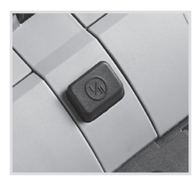
Operates in Quiet Mode (350 Watts) for daytime cleaning or Power Boost (800 Watts) for heavy-duty suction.