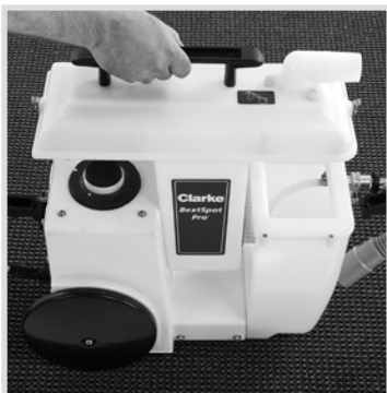
Recovery tank conveniently empties and can be rinsed.

The BEXTSpot Pro ® provides a compact, lightweight highly portable tool for quick carpet or upholstery spot clean-up. With a 1 gallon tank, there is plenty of solution capacity for the emergency small jobs that present themselves in schools, offices, food service areas or healthcare facilities. With a powerful pump and vacuum motor, this very convenient machine gets the job done fast, and can then be stored away out of sight.