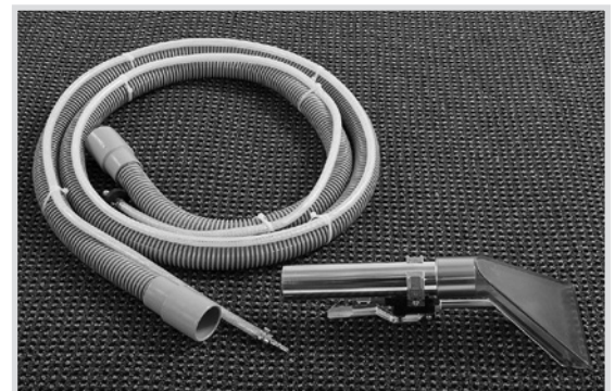
8 foot hose and clear hand tool.