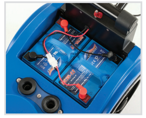
Maintenance-free AGM batteries and onboard charger.