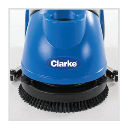
Full 15 inch cleaning path.