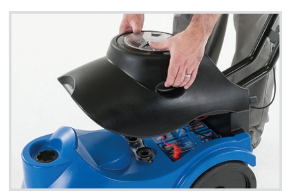
3.5 gallon lift-off recovery tank.