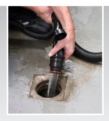
Drain Hose No-nonsense, easyflow hose makes draining the tank simple.