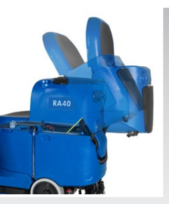
Recovery Tank Access Recovery tank fully tiltable gives easy access to battery compartment and the detergent container.