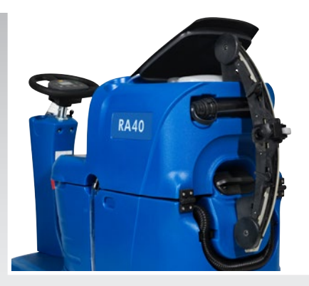
Onboard Squeegee Storage Built-in squeegee hanging system on tank allows for safe transportation through doorways and tight areas, while permitting tank drying.

CMS Control Button Clarke's exclusive Chemical Mixing System automatically mixes adjustable levels of concentrated chemicals stored in an onboard reservoir with clean water stored in the solution tank. That means you can stop wasting unused chemical, get more consistently clean floors and give the RA40 an extra boost of cleaning power for heavily soiled areas.