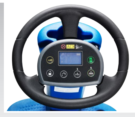
Steering Wheel Control Panel Extremely user friendly and easy to learn dashboard with One-Touch button and intuitive display integrated into the steering wheel. Exclusive multifunction digital display allows for maximum customization of machine settings.

The small profile design of the RA40 provides full sightline visibility, a short turning radius and the ability to clean in tight spaces. It also contributes to a low center of gravity that, when combined with Safe-T-Steering, prevents tipping incidents. All these features contribute to safer operation for both operators and other building occupants.