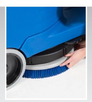
Brush Assembly Tools-free removable brushes or pads.