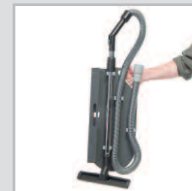
Onboard Scrub-Vac System