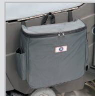
Onboard Tote Bag