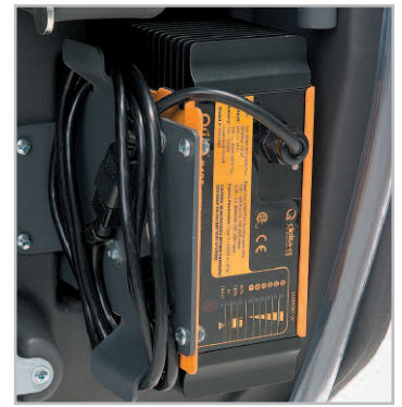
Standard onboard battery charger for wet or gel battery packages.