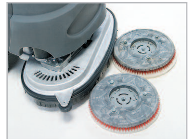
Click-off disc scrub heads for productivity and convenience.