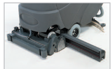
Cylindrical scrub decks sweep and scrub in a single pass with dual counter-rotating brushes. Polyethylene hopper eliminates corrosion.