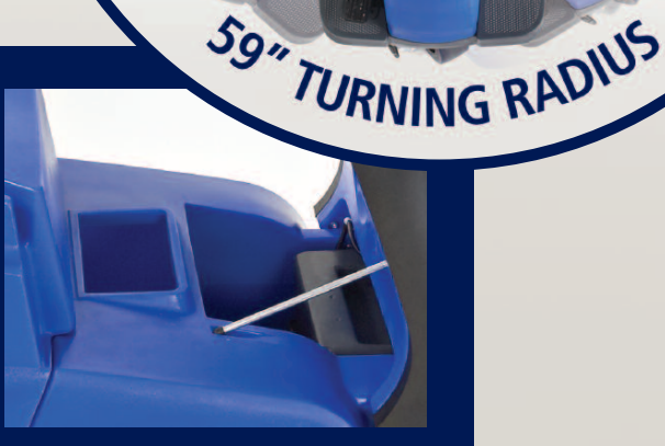
ECO System automatically dispenses solution for one hour of continuous productivity per tank