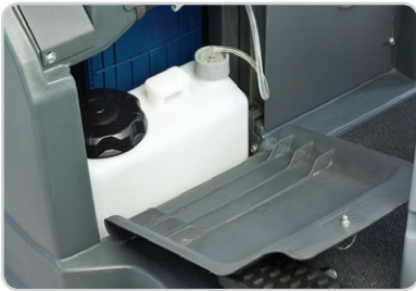
Easy access to onboard detergent dispensing system bottle on EcoFlex™ System.