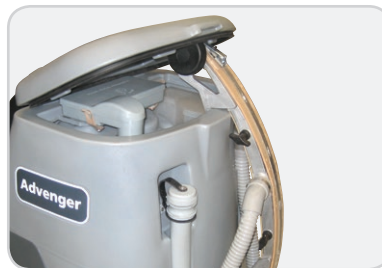
Built-in squeegee hanging system on tank for easy machine transfer and tank drying.