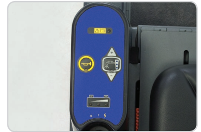
Simple one button control panel. (2800 ST model only)