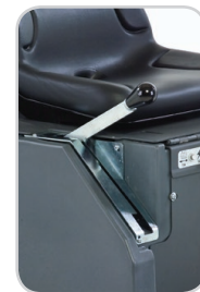
Mechanical deck lift lever. (2800 ST model only)