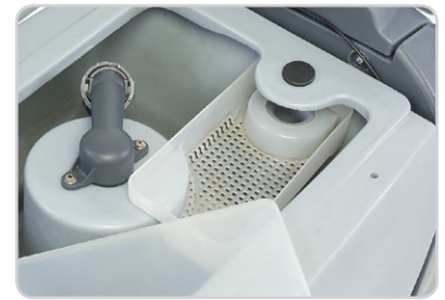
An integrated debris catch cage traps and collects drain clogging debris.