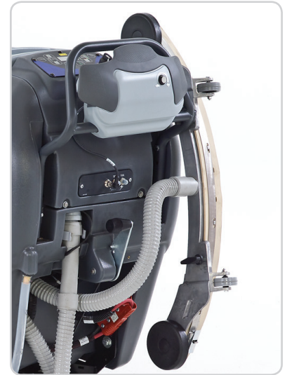
A built-in squeegee hanger makes transport easier and reduces trip and fall accidents.