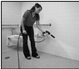
The spray gun makes dirt removal easy in hard to reach areas and allows for quick rinsing of surfaces