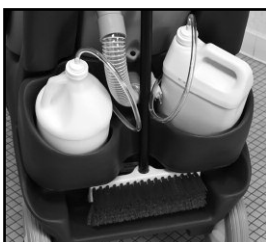
Universal chemical bottle storage