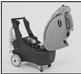
Clam shell design for easy access to the component pallet