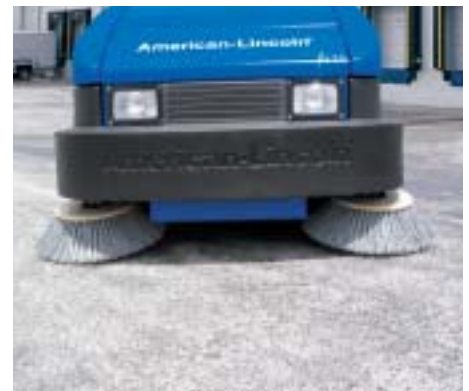
Dual side broom option sweeps a 62 inch path for increased productivity.