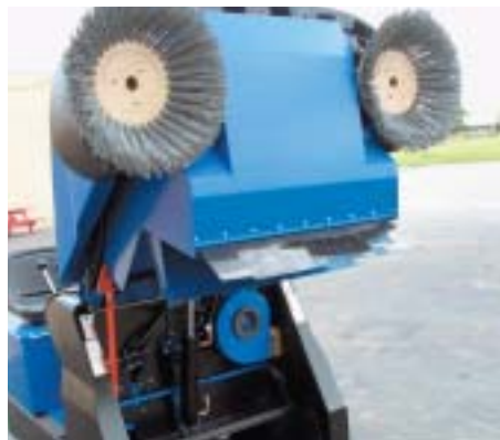
10-cubic-foot hopper dumps debris from ground level to as high as 60 inches for quicker handling.