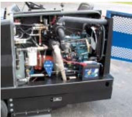
Available engine choices include Kubota 3-cylinder and Kawasaki 2-cylinder gas or LP or Kubota 3-cylinder diesel to meet your power needs.