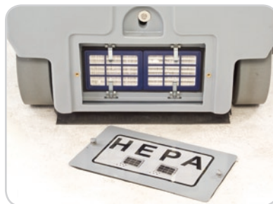
Dual H.E.P.A. filters are easy to access.

Vacuuming large, carpeted areas doesn't have to be a mountain to climb. The Advance VacRide gets the job done faster, reduces operator fatigue and provides unmatched vacuum performance on a rider platform.