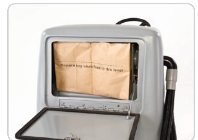
The large dust bag compartment is easy to access and has storage for an extra bag.