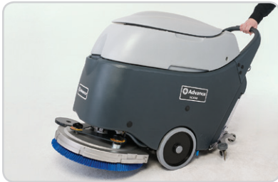
The SC450™ tips back with minimal pressure required for efficient transportation.