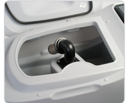
Large recovery tank with easy access allows easy inspection and cleaning.