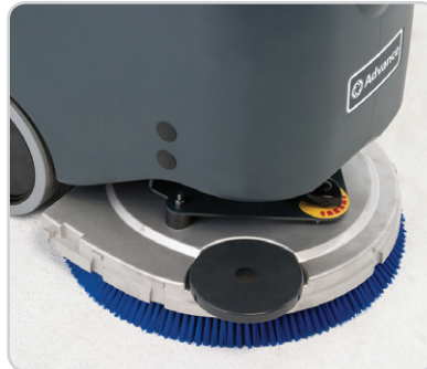
Adjustable machine deck provides increased down pressure to optimize scrubbing for heavy-duty applications.