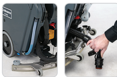
Solution drain hose also functions as the solution level indicator while large recovery drain hose offers soft, squeezable section to enable manual flow control.