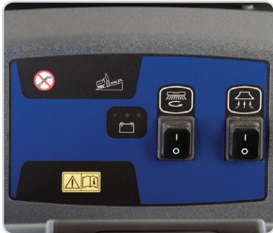
Easy-to-use control panel allows operators to operate the SC450™ by only using two buttons and a switch.