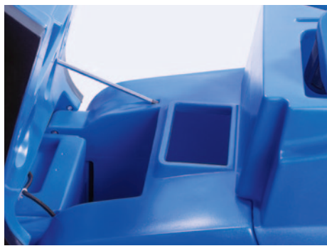
The solution tank opening is located directly under the flip-style seat. The recovery tank is up top and is easily drained by a hose located on the back of the machine.