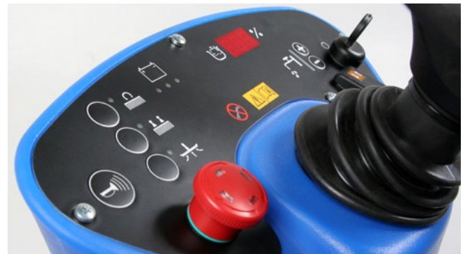
Universal One-Touch™ controls and digital solution level indicator makes the CR28 BOOST® Rider easy to operate.