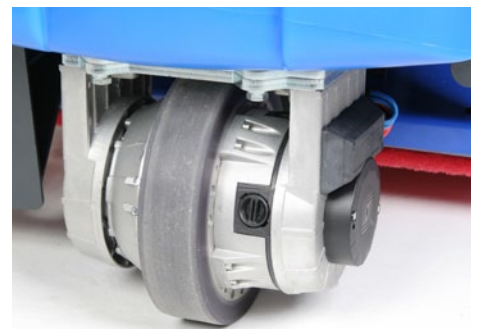
High traction tire for double scrubbing tough soils.