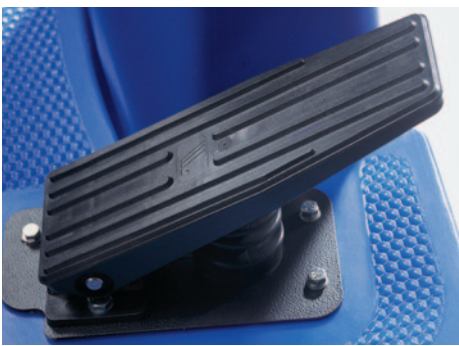
Variable speed non-skid pedal controls operator speed for precise cleaning.