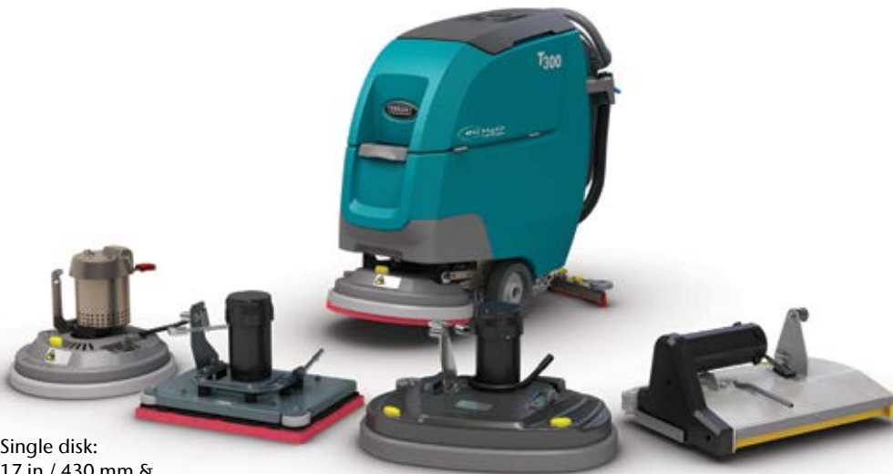
Single disk: 17 in / 430 mm & 20 in / 500 mm

The T300 scrubbers have multiple machine head types to fit your cleaning applications and optimize cleaning performance for specific areas.