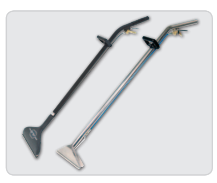
Operators have the choice to select between the light weight AquaWand™ and single or double bend stainless steel wands.