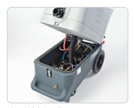
Clam shell design allows easy access to machine components, expediting servicing and maintenance.