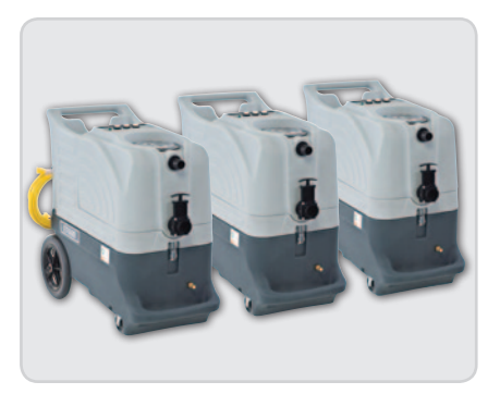
The Advance ET600 line of portable extractors is available in three models; non-heated 100-psi, heated 100-psi and heated, variable 0-400-psi to meet diverse cleaning applications.